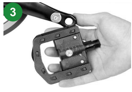
Locate the corresponding pedal according to the label. Right pedal: Rotate clockwise. Left pedal: Rotate counterclockwise.