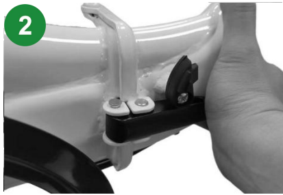
Press the folding buckle inward to complete the closing

There's a screw that prevents the buckle from closing, You need to adjust the screw into correct angle manually.