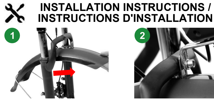
The fender follows the direction of the arrow through behind the front fork. Avoid fender brackets that fail to reach the correct position.