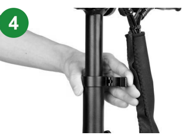
Raise the handlebar to your preferred height. Press guick release, lock the handlebar.