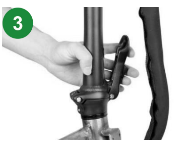
Press the folding buckle to secure the folding handlebar.